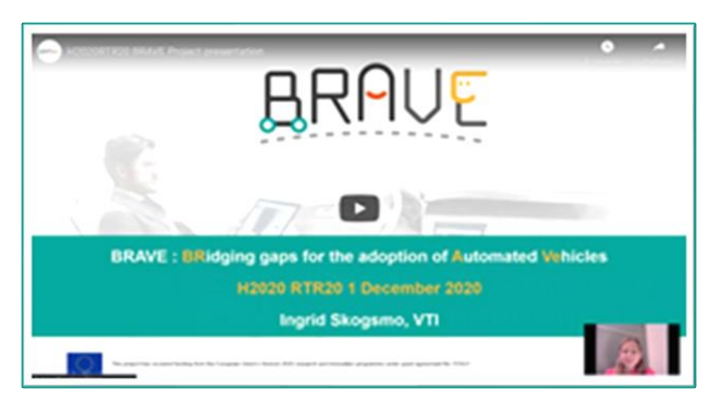
BRAVE presentation to H2020 RTR conference 2020

To access the recording: <u>http://www.brave-project.eu/index.php/2020/12/02/replay-recording-of-brave-presentation-to-h2020rtr20-conference/</u>