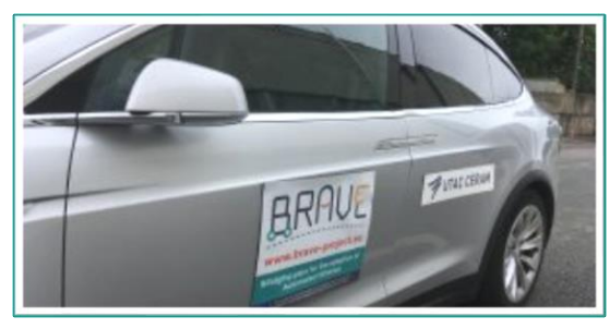
Tesla X model used for the automated drive test session in France

Tests in France were conducted together by UTAC CERAM and Mov'eo on June 12<sup>th</sup>, 2018. 13 participants had the opportunity to experience the Autopilot system aboard a Tesla X model. A 15 kilometers drive next to UTAC premises was defined, including highways. Journalists also took part in the tests. The analysis (in French) of Manon LAMOUREUX can be found on Flottes Automobiles blog.