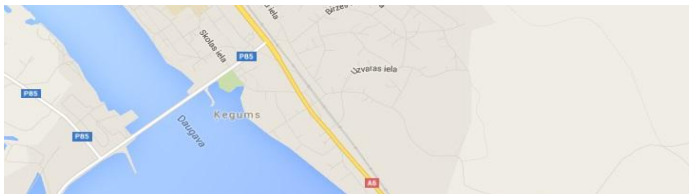
Map of the track